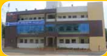
3PL Admin Building