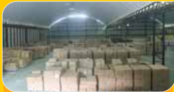
Covered Warehousing Facility